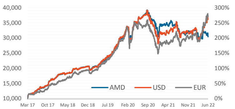
Net of management fees, operational costs, and taxes. The investment performance in AMD is translated to hypothetical performance in USD and EUR using daily rates provided by Central Bank of Armenia.